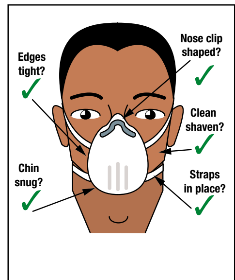
Check it! Check your mask before you put it on. Then do a fit check – for a proper fit each time