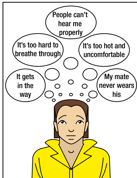
Why don't you wear a mask?