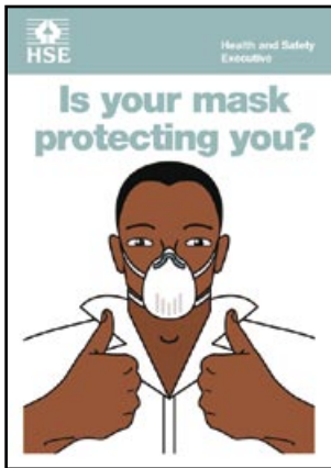
This is a web-friendly version of pocketcard INDG460, published 02/13