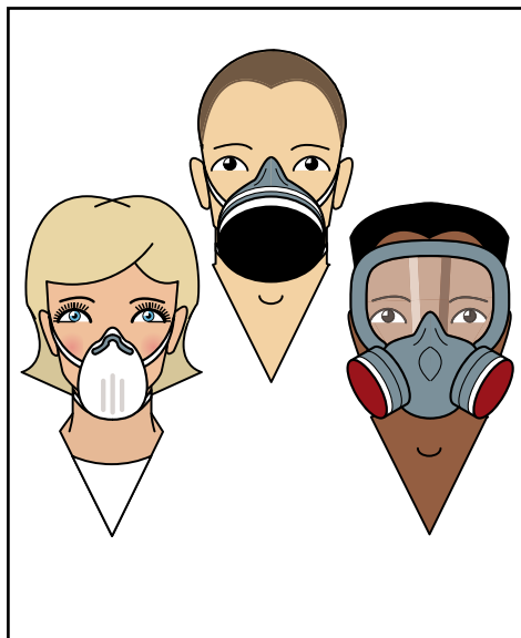
You should be fit tested and involved in choosing your mask. Different types of mask are available. Change filters regularly